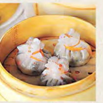
三菇石櫛標 Steamed Mushroom Dumplings $5.80