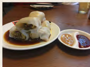
• 香茜帶子腸粉 $6.20 Steamed Flour Rolls with Scallops and Parsley