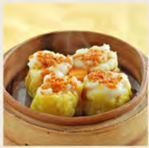
魚子滑燒賣 Steamed Shrimp & Pork Dumplings with Fish Roe $5.50