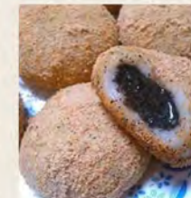
搗沙湯圓(熱) Black Sesame Glutinous Dumpling with Grated Peanut (Hot) $4.80