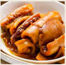
咖喱豉土魷 Steamed Cuttlefish in Curry Sauce $5.20