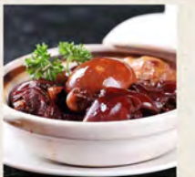
豬腳薑醋 Pig's Trotter with Ginger & Black Vinegar $13.80