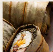
荷香珍珠雞 Steamed Glutinous Rice Wrapped in Lotus Leaf $5.80