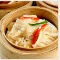
薑蔥牛百葉 Steamed Tripes with Ginger and Spring Onions $5.20