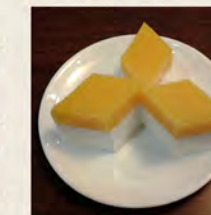
雙色椰汁糕(凍) Coconut Pudding with Mango Paste (Cold) $5.50