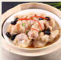
蒜茸豉汁蒸排骨 Steamed Spare Ribs with Black Bean Sauce $5.20