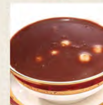
陳皮蓮子紅豆沙(熱) Sweet Red Bean Cream with Lotus Seed (Hot) $6.80