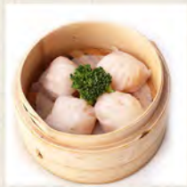
筍尖鮮蝦餃 Steamed Shrimp Dumplings $5.90