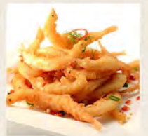
泰式白飯魚 Deep-Fried Anchovies in Thai Style $9.80