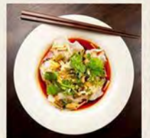
紅油北方餃子(辣) Steamed Meat Dumpling with Vinegar and Chilli Sauce $6.80