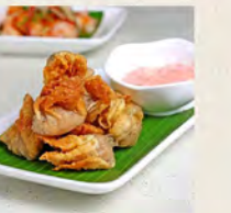
酸甜炸雲吞 Deep-Fried Wonton with Sweet and Sour Sauce (5pcs) $9.80