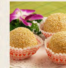
香麻煎堆仔(熱) Deep-Fried Glutinous Rice Ball (Hot) $4.80