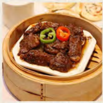
豉味南瓜牛仔骨 Stewed Beef Ribs with Pumpkin in Black Bean Sauce $8.20