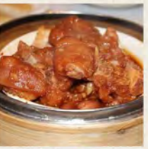
南乳豬手 Stewed Pig Trotter with Preserved Beancurd Sauce $6.80