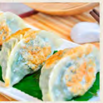
香煎韭菜餃 Pan-Fried Chive Dumplings $4.90