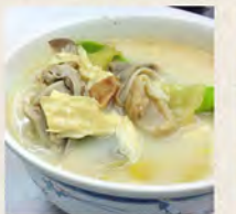
咸菜胡椒豬肚湯 Pig's Stomach Soup with Preserved Vegetables $10.80