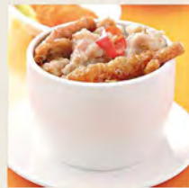
鳳爪排骨盅仔飯 Bowl Rice with Chicken Claws and Spare Ribs $9.80