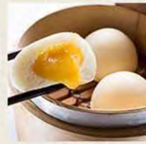
流沙奶皇包 Steamed Egg Yolk Custard Buns $5.80