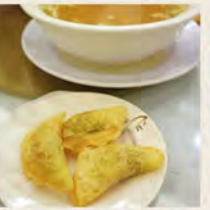
上湯瑤柱標 Deep-Fried Shrimp Dumplings in Superior Soup $4.80