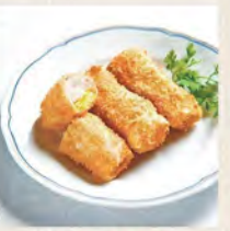
炸香芒蝦卷 Deep-Fried Shrimp and Mango Roll $5.80