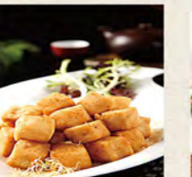
百味豆腐 Deep-Fried Hundred Taste Beancurd $9.80