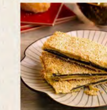
芝麻鍋餅(熱) Deep-Fried Sesame Pancake (Hot) $9.80