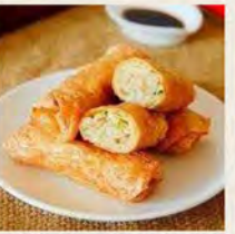
鮮蝦腐皮卷 Deep-Fried Shrimp Rolls Wrapped with Beancurd Skin $5.80