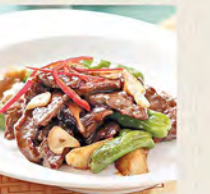
鮑汁鮮菌 Stir-Fried Wild Mushrooms with Abalone Sauce $8.80