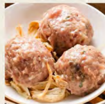
鮮牛肉球 Steamed Beef Balls with Beancurd Skin $5.20