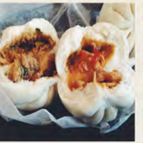
四川口水雞包(辣) SzeChuan Chicken Bun (Spicy) $5.80