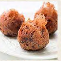
蜂蜜芋茸角 Deep-Fried Yam Dumplings $5.20