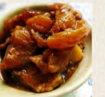
柱侯牛根腩 Stewed Beef Brisket with Turnip $12.80