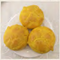
菠蘿叉燒包 Baked Bo Lo Bun with Barbecued Pork $5.80