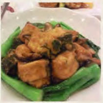
鮑汁豆腐 Stir-Fried Beancurd with Abalone Sauce $6.80