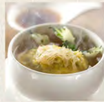
花膠瑤柱翅骨湯餃 Fish Maw & Conpoy Dumplings in Shark's Bone Cartilage (Per person) $15.80