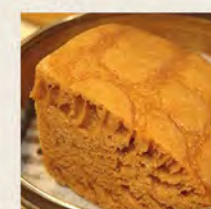
攪仁馬拉糕 Steamed Sponge Cake $4.80