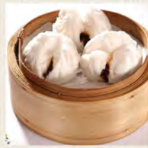
綠豆叉燒包 Steamed Barbecued Pork Bun $4.80