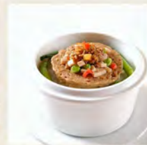
咸鱼肉餅盅仔飯 Bowl Rice with Mincing Pork and Salted Fish $9.80