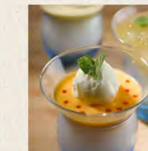
楊枝甘露雪糕(凍) Chilled Mango Puree with Sago Served with Ice Cream (Cold) $8.80