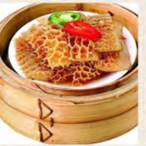
柱侯金錢肚 Braised Beef Honeycomb Tripe with Chu-Hou Sauce $5.20