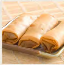
煙鴨胸春卷 Deep-Fried Shredded Smoked Duck Breast Spring Roll $4.90