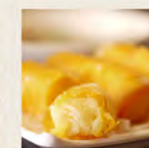
脆皮馬蹄條 Deep-Fried Water Chestnut Roll $4.80