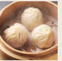
上海小籠包 Shanghai Meat Dumplings $5.50