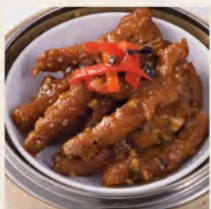
豉汁蒸鳳爪 Steamed Chicken Claws with Black Bean Sauce $4.80