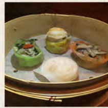
大四喜點心拼盤 Prosperous Dumplings Platter $6.80 (Per pax) $8.80 (After 5pm)