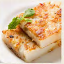
臘味蘿蔔糕 Pan-Fried Carrot Cake $4.80