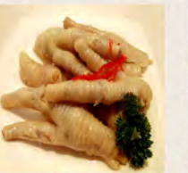
白雲鳳爪 Chilled Chicken Claws $9.80