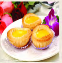
酥皮蛋撻仔 Mini Egg Tarts $4.80