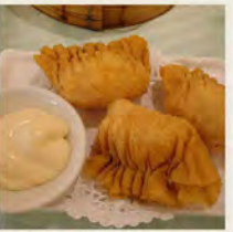
沙律明蝦角 Deep-Fried Prawn Dumplings $5.80