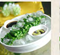
冰鎮芥蘭邊 Chilled Hong Kong Kai Lan $8.80