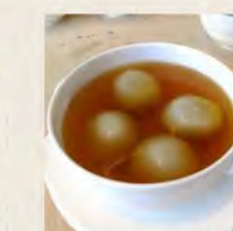
薑茶湯圓(熱) Black Sesame Glutinous Dumpling in Ginger Soup (Hot) $4.80