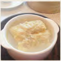
魚湯鮮竹卷 Braised Beancurd Skin Rolls in Rich Fish Soup $8.80